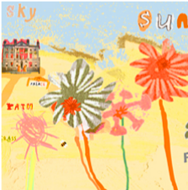
Figure 5. Children wave their arms to make the flowers grow and the sun disappear.