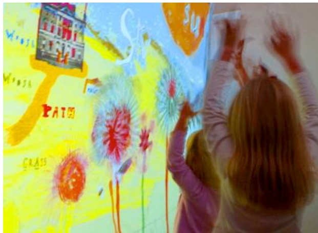
Figure 7. Testing the Wordscape system.

Which are the most effective methods for data collection and evaluation of the prototype? What are the most appropriate methods for recording target workshops (photographic, digital video, questionnaire, discussion...)? We are continuing to develop and refine the wrist cuff's technical components including the use of accelerometers (to sense movement, i.e. waving arms), microphones (to detect sounds, i.e. shouts), pressure sensors (to detect impacts, i.e. clapping hands), using Bluetooth technology to allow wireless transmission to computer, a micro-controller (to analyse data), lightweight rechargeable batteries, durable and washable textiles and printing of graphics. During the testing of the prototype children were able to add their own drawings, writing, letterforms, mark making... (which they loved) and we aim to develop the system so that this process is faster and more efficient.