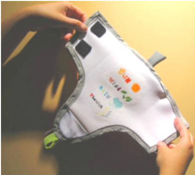
Figure 3. The wrist cuff with Velcro fastenings and printed graphics.