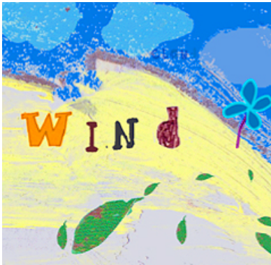
Figure 6. Children control the wind.

Which are the most effective methods for data collection and evaluation of the prototype? What are the most appropriate methods for recording target workshops (photographic, digital video, questionnaire, discussion...)? We are continuing to develop and refine the wrist cuff's technical components including the use of accelerometers (to sense movement, i.e. waving arms), microphones (to detect sounds, i.e. shouts), pressure sensors (to detect impacts, i.e. clapping hands), using Bluetooth technology to allow wireless transmission to computer, a micro-controller (to analyse data), lightweight rechargeable batteries, durable and washable textiles and printing of graphics. During the testing of the prototype children were able to add their own drawings, writing, letterforms, mark making... (which they loved) and we aim to develop the system so that this process is faster and more efficient.